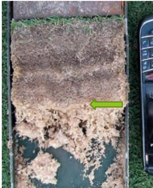
Without VIGO - Soil profile of golf course green after six months with a pronounced hydrophobic 10 mm thatch layer. (Control)

“I did see a great improvement in leaching out of greens thatching with no detrimental effects on the grass or damage to the playing surface.” - (Feedback: Golf Course Superintendent after applying Vigo for Agri)