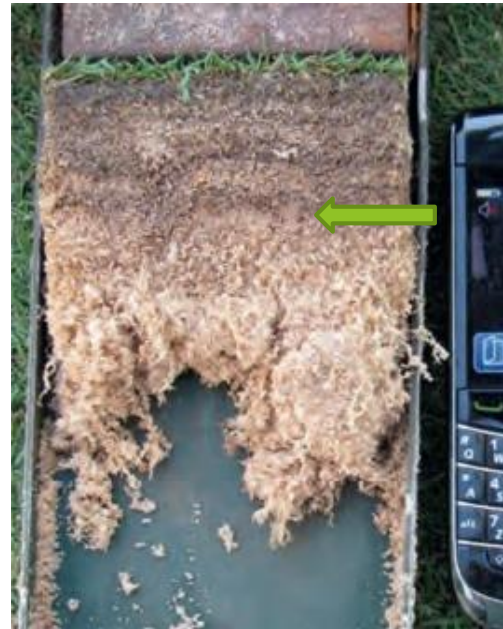
With VIGO - Soil profile of treated area after six months showing a narrow diffusing 3 mm thatch layer.