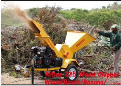
Ritlee 225 Std Gravity Feed Trailer + Grinder