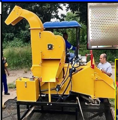
Screen Size Available