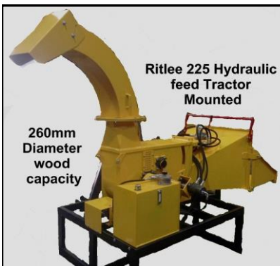
Ritlee 225 Std Hydraulic Feed Tractor + Grinder