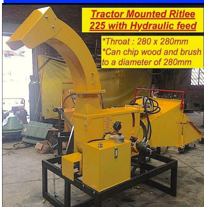
Tractor Mounted Ritlee 225 with Hydraulic feed *Throat : 280 x 280mm *Can chip wood and brush to a diameter of 280mm