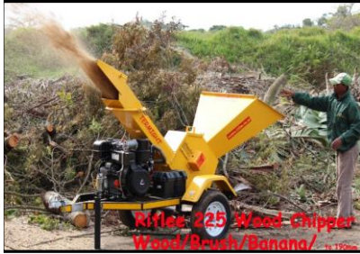
Ritlee 225 Wood Chipper Wood/Brush/Banana/ ...