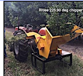
Ritlee 225 90 deg chipper