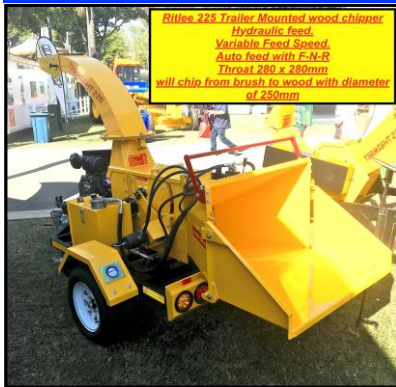
Ritlee 225 Trailer Mounted wood chipper Hydraulic feed, Variable Feed Speed, Auto feed with F-N-R Throat 280 x 280mm will chin from brush to wood with diameter of 250mm