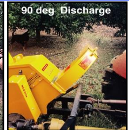
90 deg Discharge