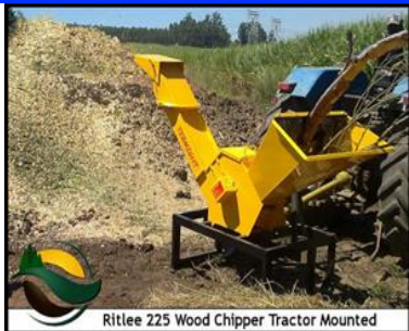
Ritlee 225 Wood Chipper Tractor Mounted